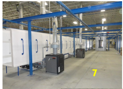
(7) 6 stage PEM Custom Pretreatment system ready for the first parts to paint .