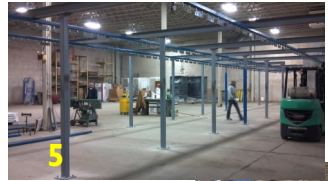
(5&6) New automated line is added.

In the December Newsletter we told you about AFI's expansion project. We have leased another building which brings our total production space to 52,000 square feet. Our new facility has a 6 stage (70 foot) PEM Custom Pretreatment System using RO water to improve salt spray and reduce chemical usage. This system will almost double our capacity to handle large volume orders. The new line has over 700 feet of track which can run up to 6 feet per minute. We have added 200 additional feet of cooling which will be best suited for dense or heavy parts. The powder booths are designed for quick color changes. Our new location supervisor will be Mike Barton. As you view the pictures in this article, we show the progress since December. AFI II (the sequel) is in full production. We want to thank our many customers that have been so patient with us during this time of transition. It is our customers that motivate us to improve and expand to meet their needs. You are welcome to come down any time for a visit and a tour. Special thank you to all the vendors that helped make this happen. Skogen Mechanical, Electric Services LLC, Blue Earth Environmental, Riverfront Technologies, McGowan Water Conditioning, CenterPoint Energy, Xcel Energy, City of Mankato, Greater Mankato Growth, and United Prairie Bank.